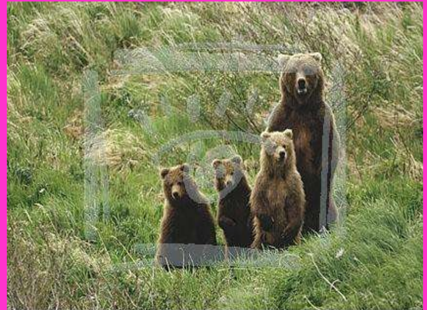
MP00-8752 ALASKAN BROWN BEAR (Ursus arctos) MOTHER STANDING WITH THREE CUBS, ALASKA