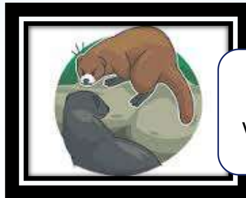
Competition for food and habitat with the American Mink.