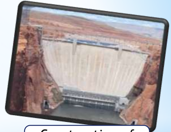
Construction of river dams.