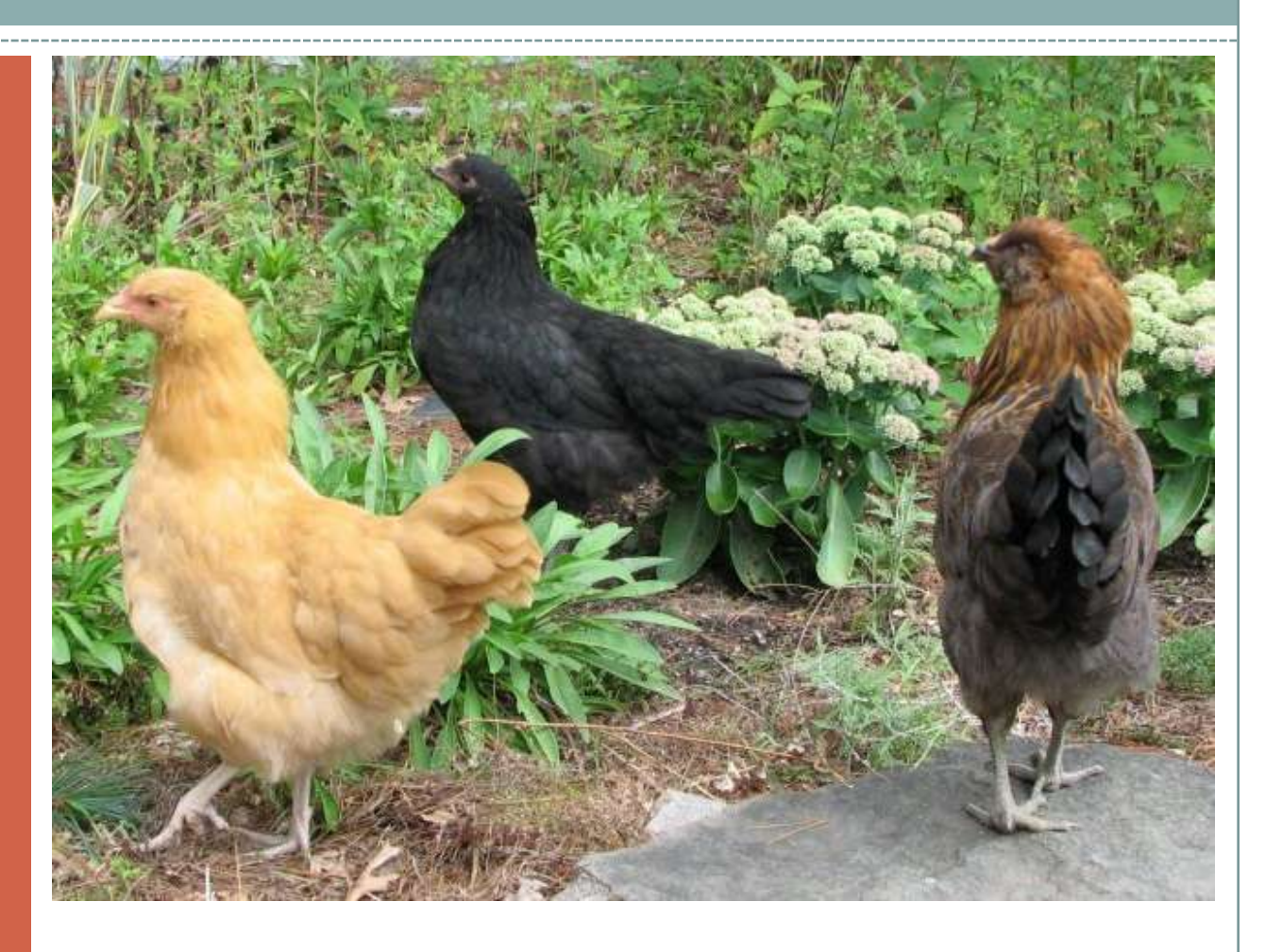
Waddle, KJ and Hippy Chick (12 weeks old in this photo)

Easter Egger: A hybrid, not a true breed, usually lays a green egg (ours lays a brown egg however)