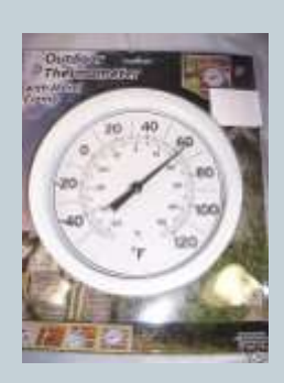
Thermometer (inexpensive is fine)